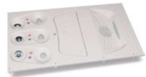
Goodrich Hella Aerospace Lighting System's passenger service unit using ULTEM resin