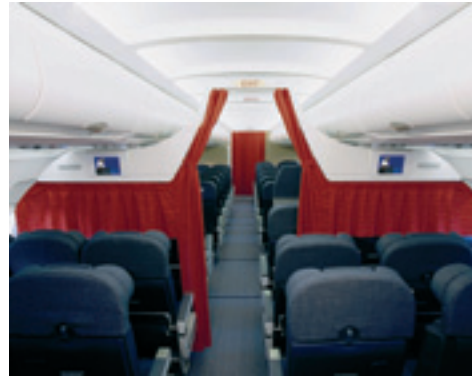
SABIC provided parts made from ULTEM 1668A sheet for the development of Adder cabin dividers.

By incorporating ULTEM 1668A sheet, designers can achieve halogen-free compliance along with superior stiffness and the ability to safely combine with leather-based decorative skins as well as a variety of adhesive systems used for bonding to plastic substrate. Application opportunities for this advanced lightweight material include first-class and business-class seats and cockpit panels.