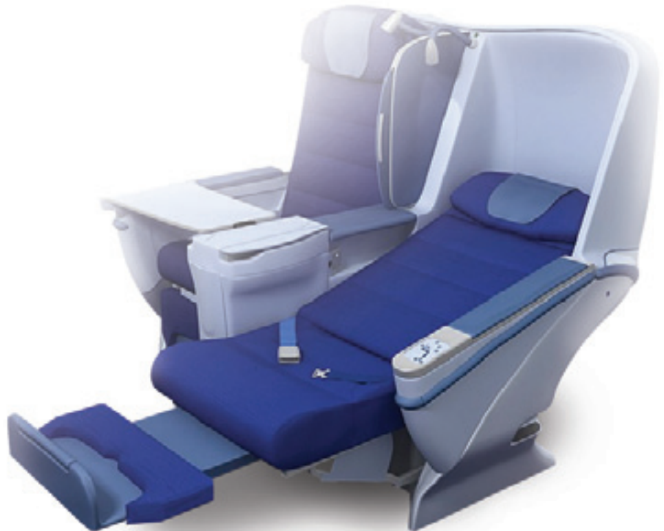
EADS Sogerma's first and business class seats use SABIC's LEXAN sheet.

Versatile LEXAN CFR5630 resin is suitable for small opaque parts such as window and seating components.