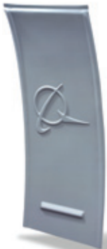
Thermoformed by Texstars Inc., ULTEM 1668A sheet forms the entire cockpit of C17 jetliners. The material was chosen for its flame, smoke and toxicity performance and for its exceptional impact strength.

ULTEM 9085 resin is a new-generation product that goes beyond compliance with better flow, improved impact performance, lower processing temperatures and a wider processing window – all while maintaining its high modulus and heat resistance. For customers, that means key advantages like thinner walls, lower cost and lighter weight. ULTEM 9075 resin is a product with a proven track record in the aircraft industry for use in many cabin interior applications such as passenger service units and window frames. For extruded profiles, ULTEM 9076 resin has lower flow behavior, allowing an improved processing window.