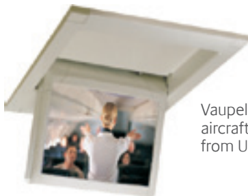
Vaupell Industrial Plastics aircraft video display molded from ULTEM 9075 resin